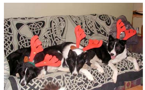
Out-of-work reindogs. Can pull sled and fly. Available immediately.

Although we are hopeful that we can successfully integrate two adult wolves into our pack, beginning with the introduction to the youngest member, Moab, we do realize that anything can happen. We have never attempted this before, and we will keep everyone updated on the progress.